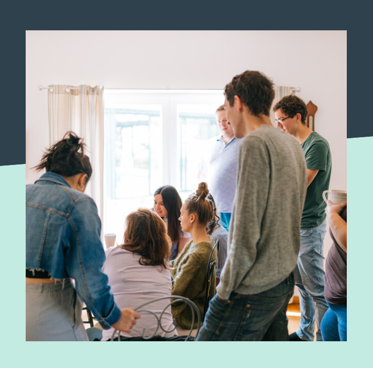
Capacity of Community Members